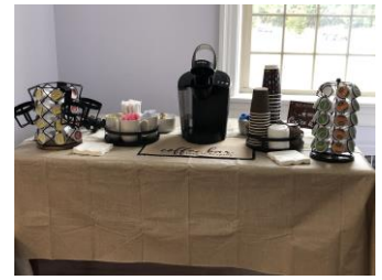
New Coffee Bar